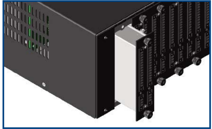
View of ZPU-5000 plug-in modules